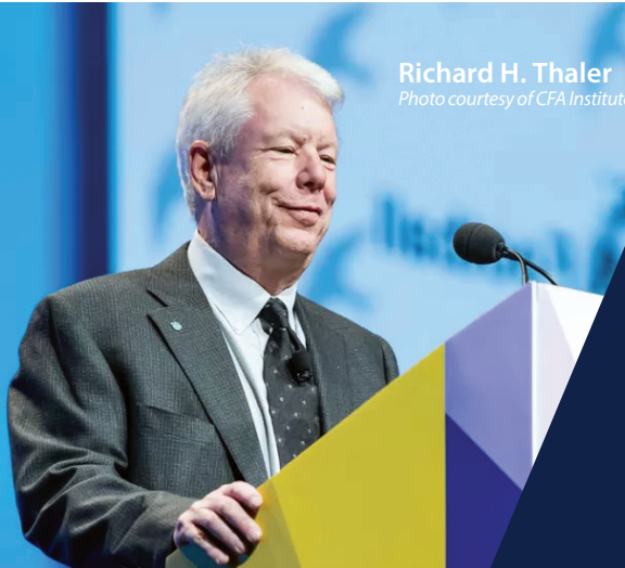
Richard H. Thaler